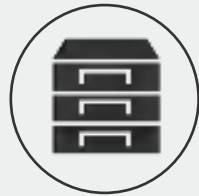
Modular & Stacked Design