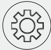
Long service life