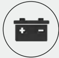
Battery energy management system