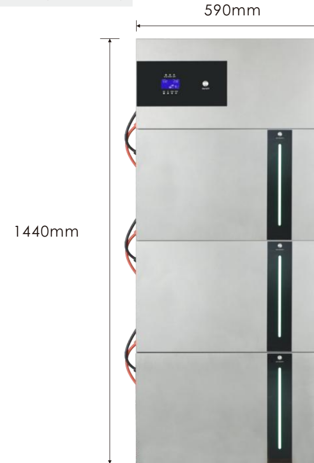
Product Size (Unit: mm)